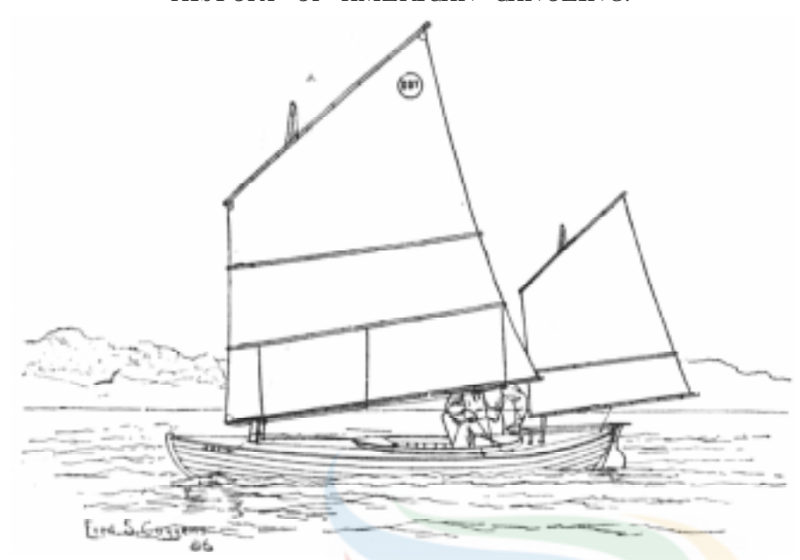
NEW YORK BALANCE LUG RIG, 1882.

The drawing shows the Dot as it was rigged in 1882, spreading about 80 square feet of muslin in all. There were two reefs in mainsail and one in mizzen. A reefing gear was used, by which the reef could be taken in by simply dropping the sail a little and pulling up the slack on the reef-line—the boom and first batten were brought together and the cloth between them neatly gathered in. The canoe had a 2/2 inch keel and no centerboard; it was steered with a tiller, the crew always sitting on deck when sailing. Fifty pounds of shot ballast was carried. The mast-tube was placed a little over three feet from the stern in all canoes built prior to 1881, as a jib was generally used. When the balance lugsail was introduced the mast had to be set well forward to prevent the canoe having too much weather helm. This shifting of the mast cut up the decks of the old canoes badly, and it was a common sight in 1882 to see two and three patches on the decks of the canoes covering former mast-holes. The pointed flare coaming was put on Dot in 1880, and has since been generally adopted. been generally adopted.