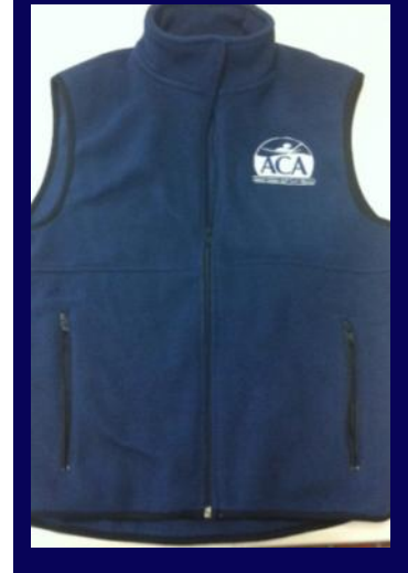
You can get this and more in the ACA eStore.

Check out and subscribe to the <u>ACA</u> <u>YouTube Channel</u> to see each new episode. You can also visit the R3 page on the ACA website at <u>www.americancanoe.org/R3</u>.