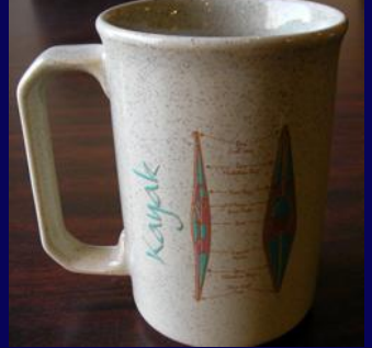
You can get this and more in the ACA eStore.