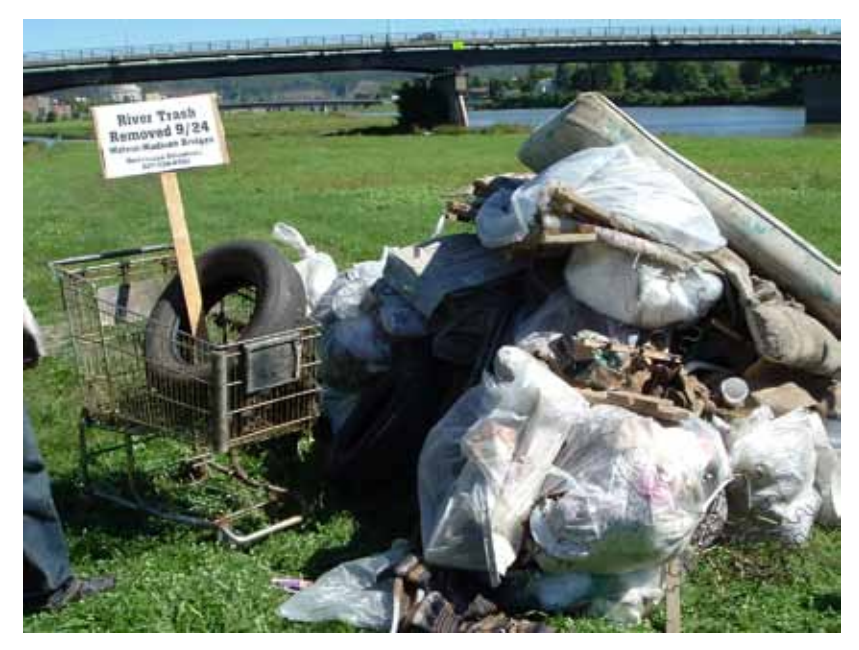
6—ACA Club-Fostered Stewardship Report

At the five cleanup sites run by Coastal Rivers, 83 volunteers contributed 352 volunteer hours, cleaned ten miles of shoreline and removed 1600lbs of litter... One standout kayaker, working alone, removed 300 lbs of trash from Lamotte Bayou near the town of Gautier, MS.