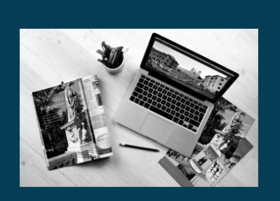
PADDLE E MAG The SEI Department seeks, collects, and reviews content submissions for Paddle eMagazine. In addition, they design, publish, and release the bi-monthly eMagazine.