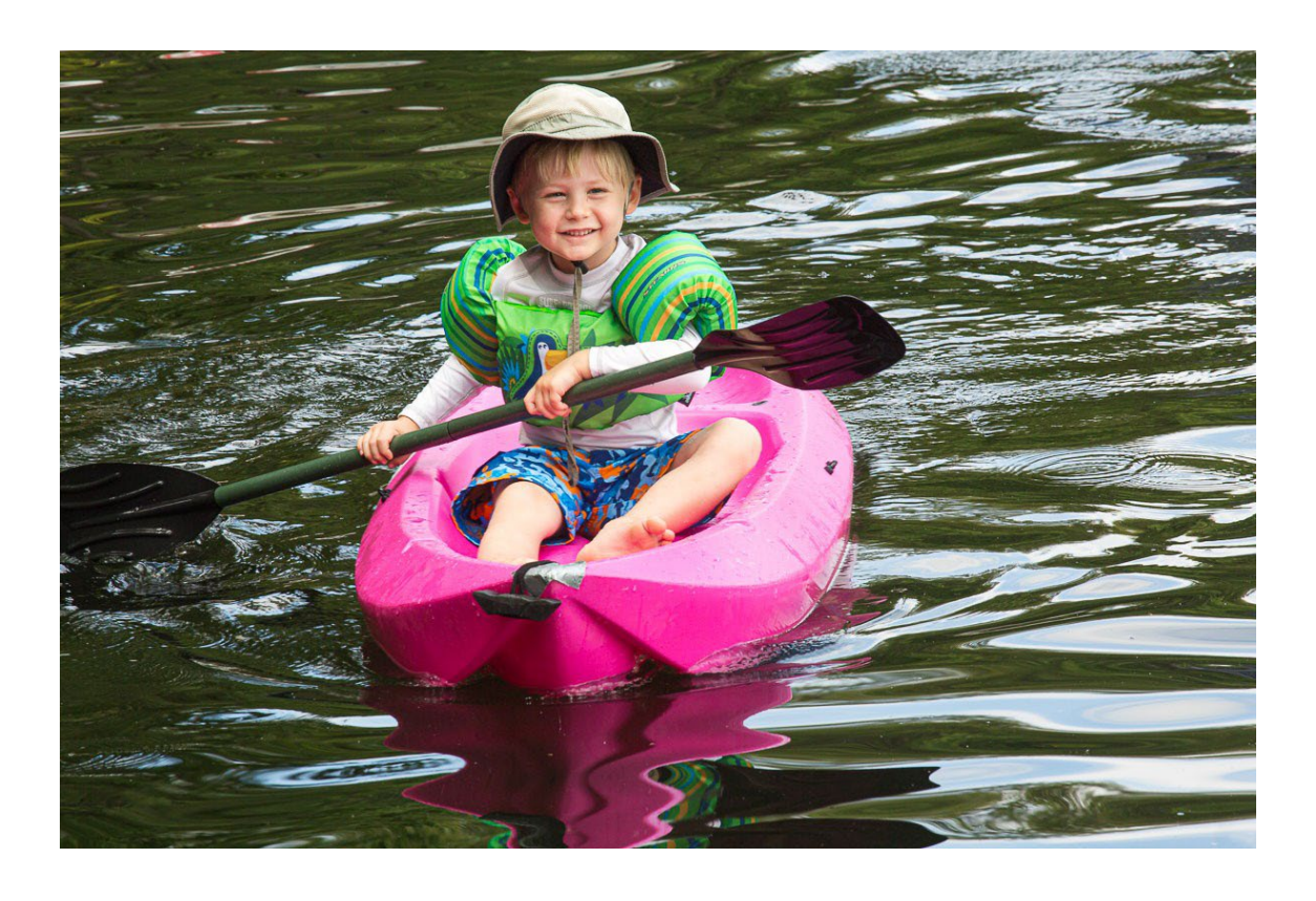
Ready for his first scupper race at the ACA Camp at Lake Sebago.