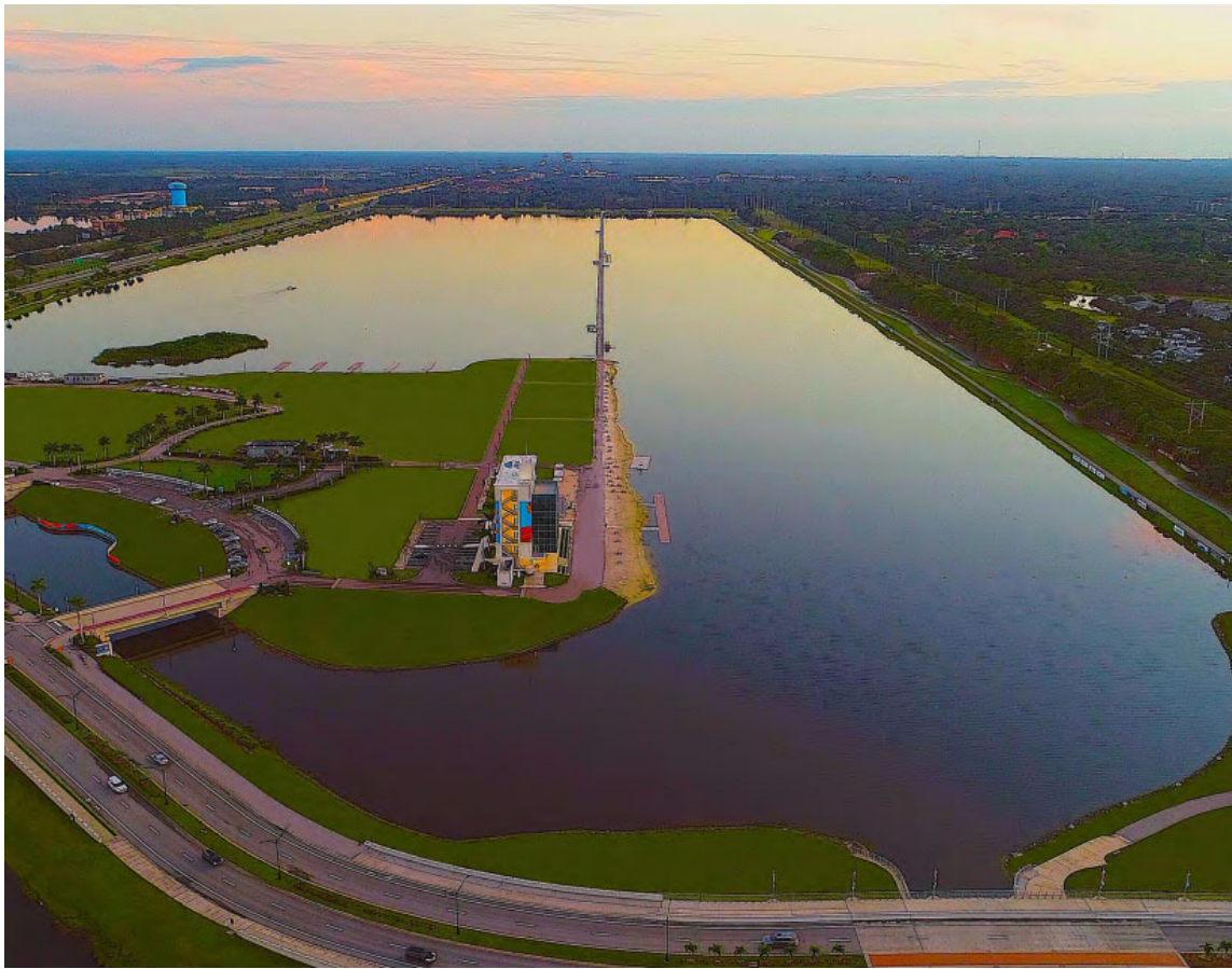
Nathan Benderson Park Regatta Venue, the host of the 2023 ACA Sprint Canoe National Championships!