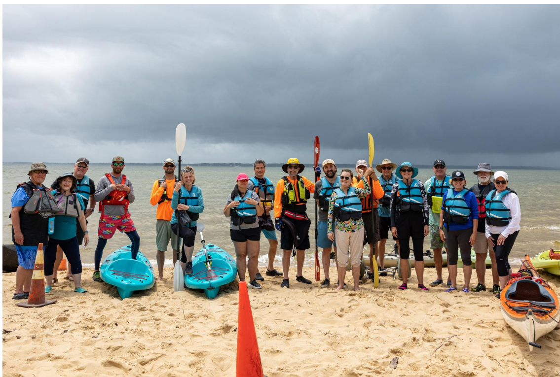
Group photo shared on ACA North Carolina's Facebook page from one of the Kayaking 101 Courses taught over National Safe Boaters Week!

¡Estamos muy orgullosos y emocionados de poder ofrecer un curso de seguridad de remo por el ACA, de gratis y en español!