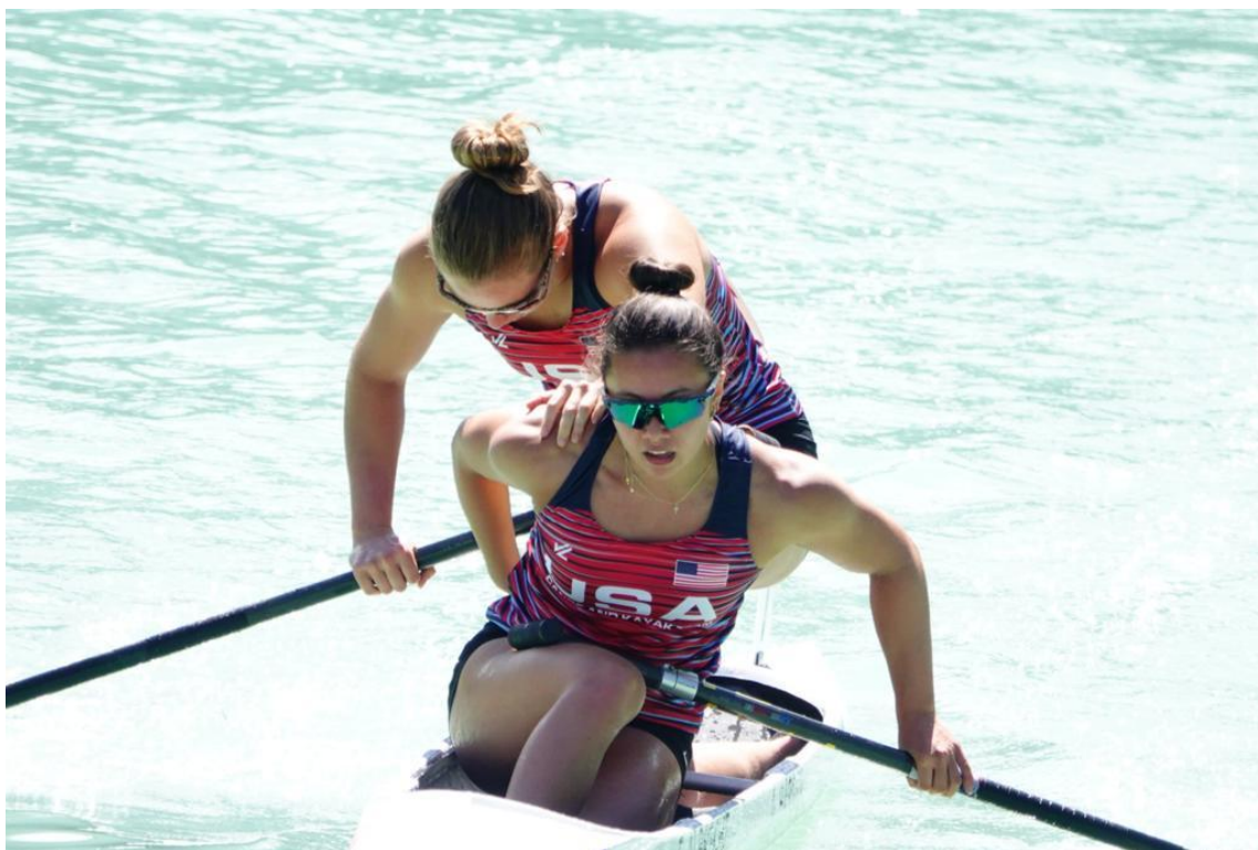
U23 C2 Women, proud of their effort in a close semifinal