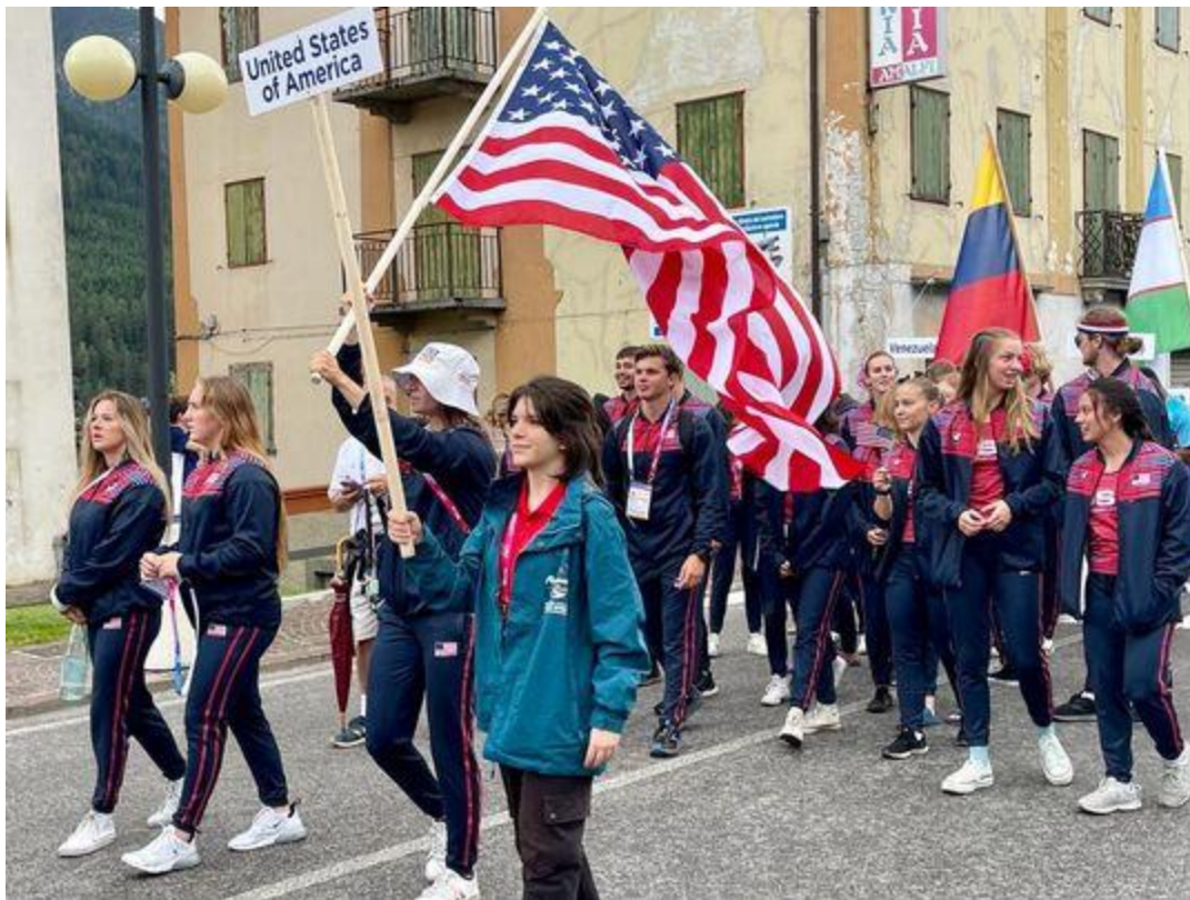
Members of the U.S. Junior and U23 Sprint Canoe National Team at the opening ceremony in Auronzo di Cadore, Italy for the 2023 ICF Junior/U23 Sprint Canoe World Championships