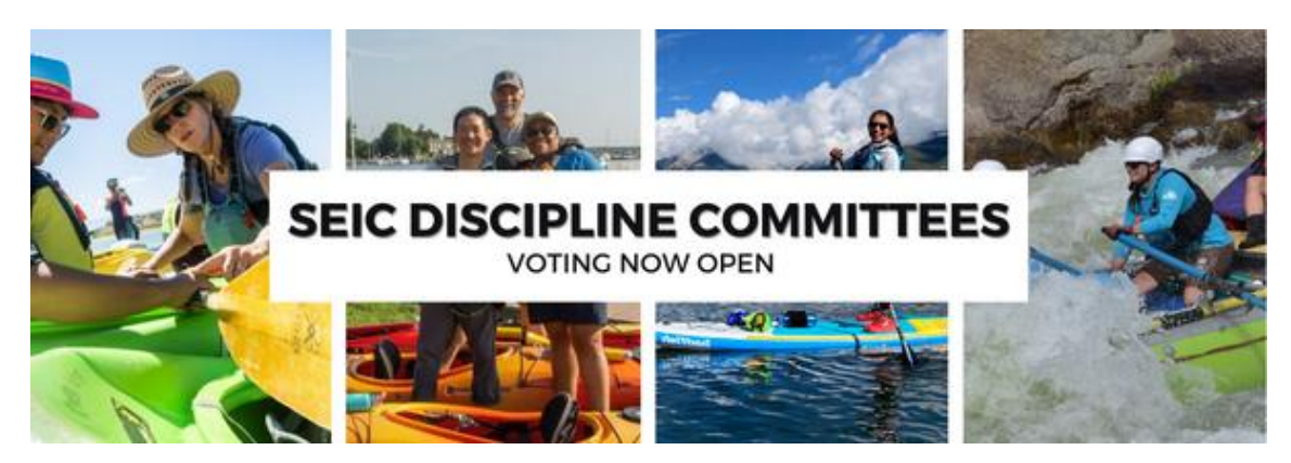
Calling all currently certified ACA Instructors, Instructor Trainers, and Instructor Trainer Educators!

You are invited to cast your vote regarding the nominees for each discipline committee in which you are currently certified! *You must be logged into your ACA membership account to vote.