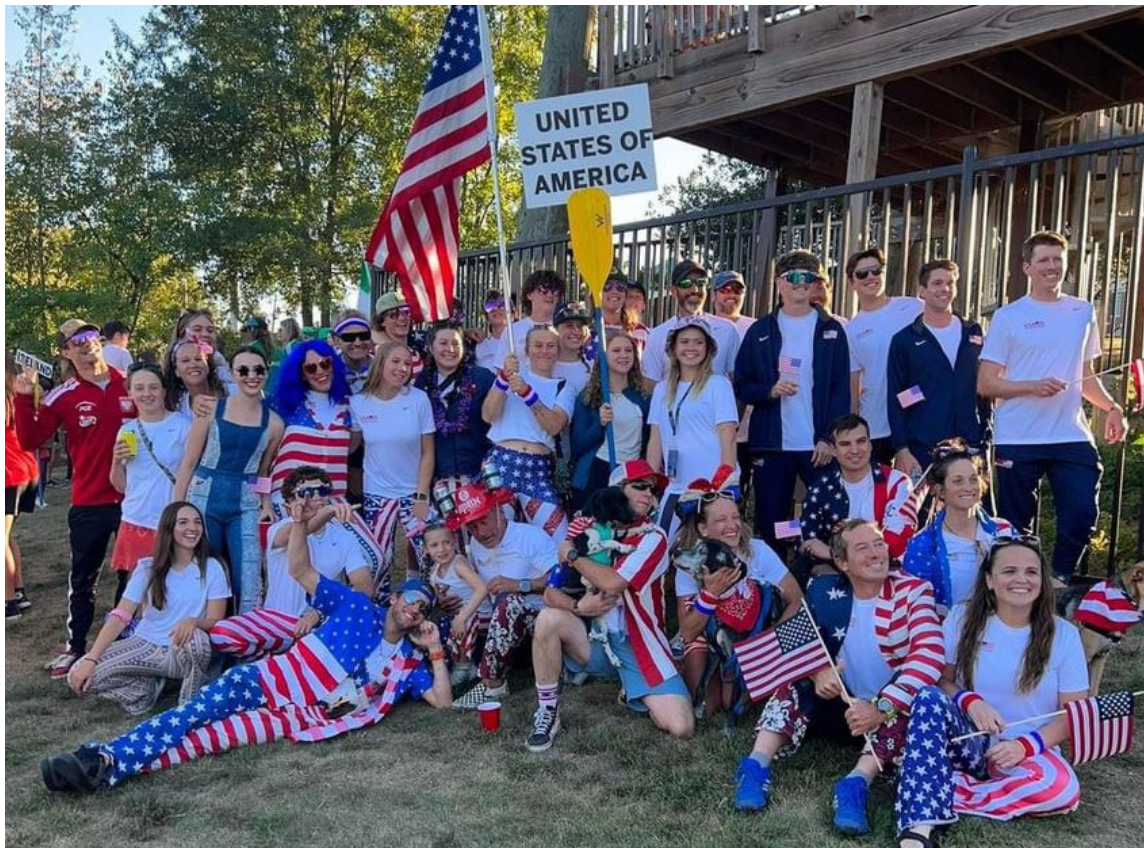
USA Freestyle Kayak National Team at the Opening Ceremony of the 2023 ICF Canoe Freestyle World Championships