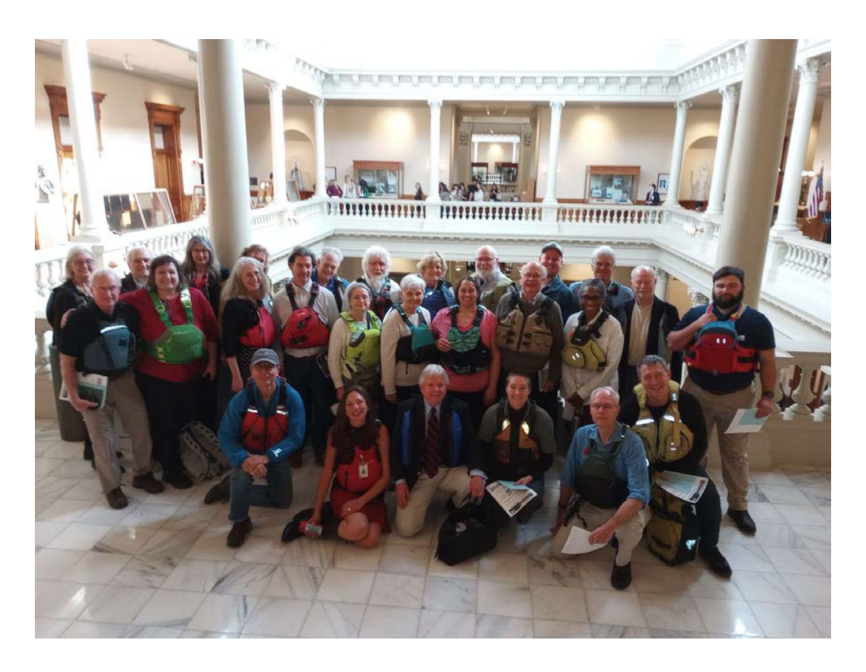
Boater's Day at the Georgia State Capitol