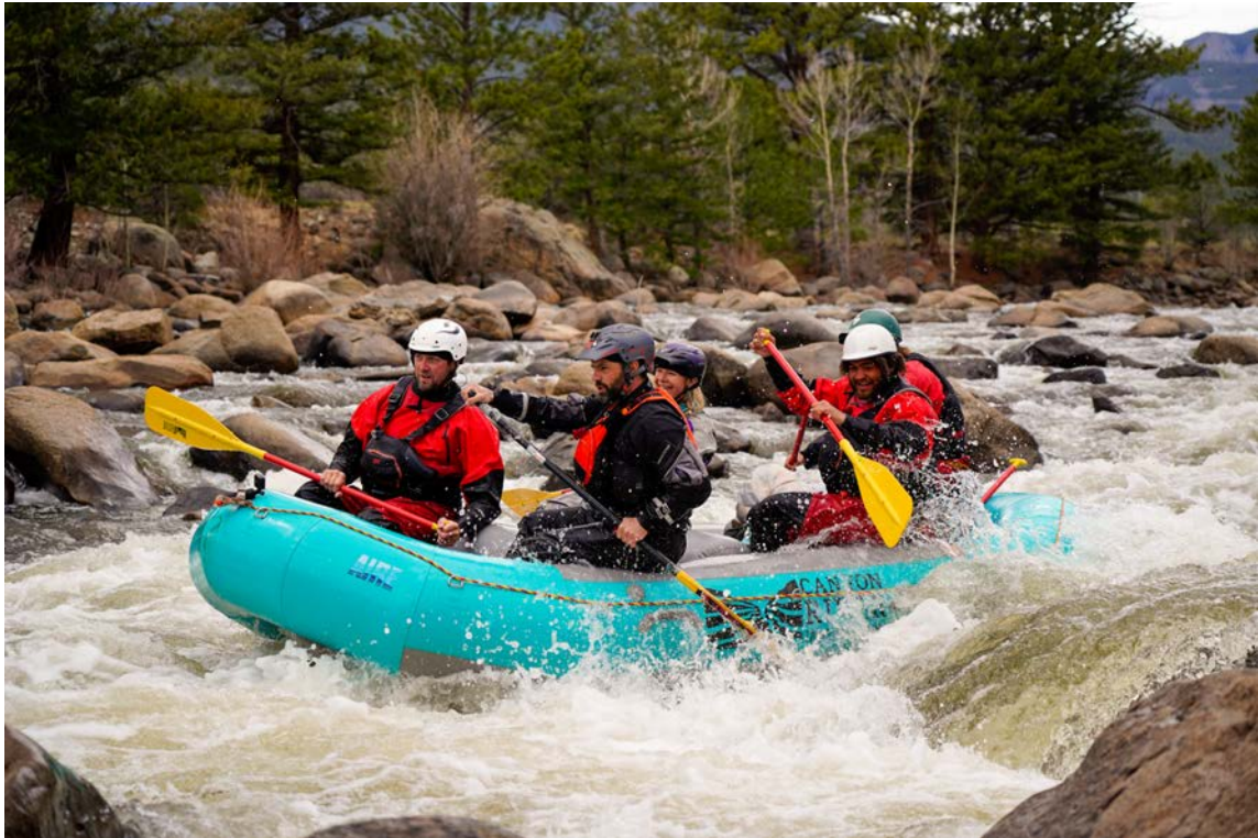
Paddle rafting course with ACA Pro School, Canyon River Instruction!

“At CRI, our goal is to make river running a safer, more accessible, and more enjoyable experience. We strive to create a learning and resource center for all types of river-running skills including rowing, paddle rafting, multi-day river trips, kayaking and river rescue. We bring together resources to help people become enthusiasts and enjoy a lifetime of river running experiences with emphasis on safety, experiential learning, custom instruction and river stewardship. Whether you are new to the river and excited to learn a new sport, want a better understanding of river safety, need a Swiftwater Rescue training, are looking to brush up on old skills or are ready to step up your game and tackle bigger rapids, we are here to help you achieve your whitewater goals.”