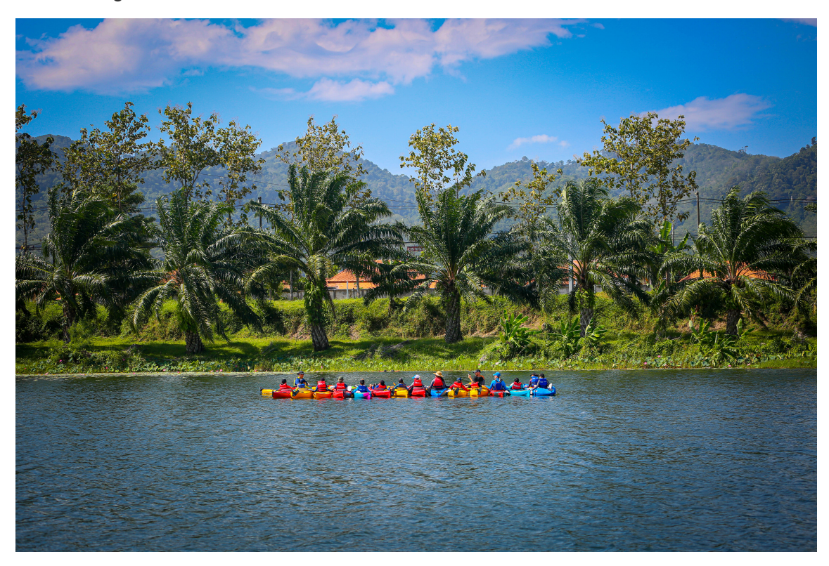
ACA Pro School, UWC Thailand