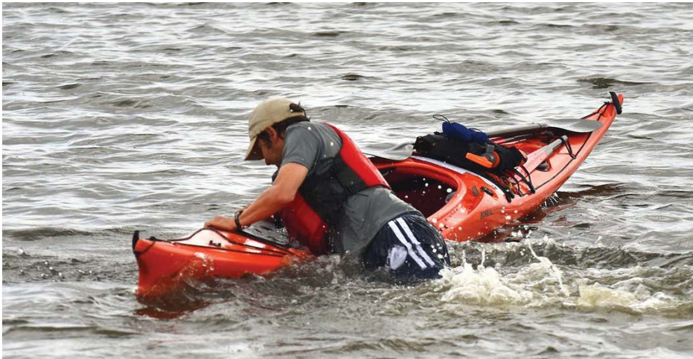
Hammocks Beach State Park, NC, 2023

These classes have demonstrated a remarkable impact on their communities, achieving the following metrics of success in 2023: