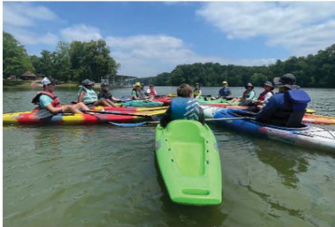
Meeman-Shelby Forest State Park, TN, 2023

These classes are made available by certified instructor volunteers, safety boaters and equipment donations from many organizations coming together to help their fellow paddlers across 6 states. Valued partners joining the American Canoe Association and US Coast Guard Auxiliary in this effort in each state include: