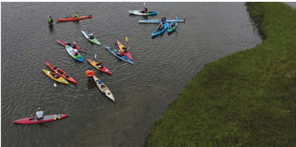
Hammocks Beach State Park, NC, 2023