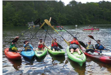
Cliffs of Neuse State Park, NC, 2023

Tennessee: Appalachian Paddling Enthusiasts, Blues City Kayaks, Bluff City Canoe Club, Catalyst Sports, Chattanooga Therapeutic Recreation Services, Chota Canoe Club, East Tennessee Whitewater Club, Knoxville Kayaking Clinic, Nolichucky Outdoor Learning Institute, Sunseeker Outfitters, Team River Runner-Atlanta, Tennessee Scenic Rivers Association, Tennessee Valley Canoe Club, and Tennessee RiverLine.