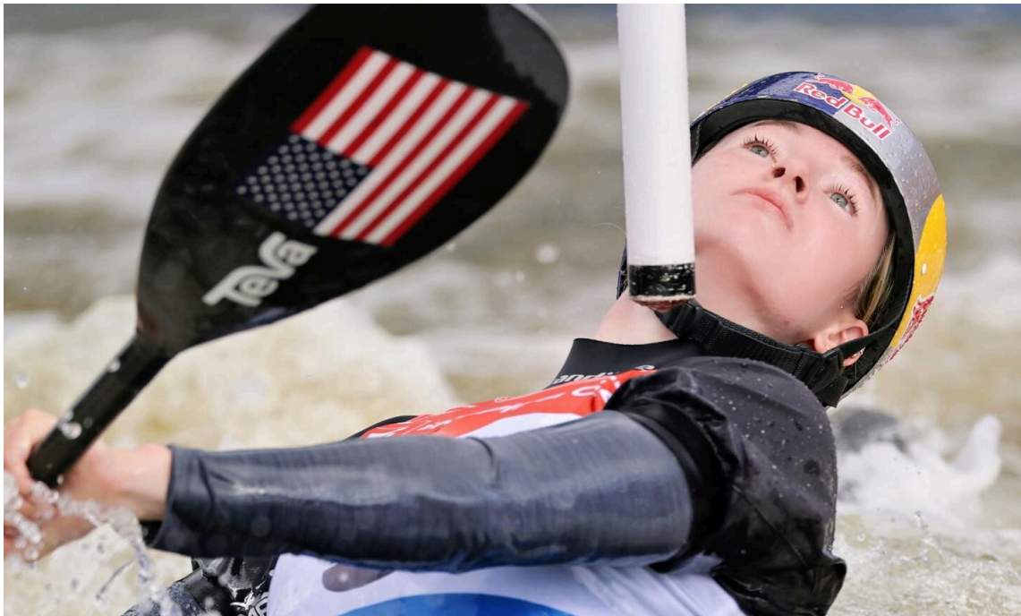
Evy Leibfarth at the 2025 ICF Canoe Slalom World Cup - Prague