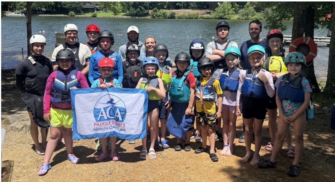
Youth Kayaking 101 course held as part of National Safe Boating week, at Lake Norman YMCA in Cornelius, NC.

For the fourth year in a row, ACA volunteers joined forces with local paddling leaders to deliver beginner-friendly paddling classes to kick off National Safe Boating Week. This initiative, recognized in 2024 with the Community Impact Award from the National Safe Boating Council, brings paddlers, volunteers, and organizations together to help beginners learn safe paddling skills and foster connections within the paddling community.